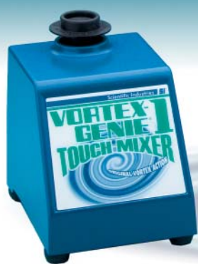
HIGH SPEED MIXER